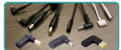
Emulator Adapter Cables

65W output max per USB-C port 500W output max per hub Overcurrent, overvoltage protection