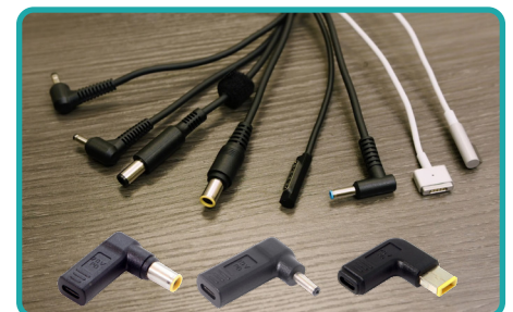
Emulator Adapter Cables

The Elevate Max USB-C Charging Cart is the pinnacle of efficiency for charging, securing, and transporting large sets of up to 36 devices. Powered by Quick-Sense USB-C PD, there is no need to plug in and arrange messy AC adapters. Plug devices into the included connectors and enjoy quick and efficient charging. The cart's slender footprint, double doors, and swivel casters make devices easily accessible—even in small spaces. The high-capacity Elevate Max USB-C Charging Cart has larger device bays to suit a broader range of device sizes, up to 17-inch screen size.