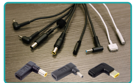
Emulator Adapter Cables

The Elevate line of carts features all of the key considerations of what schools need in a charging cart. They weigh significantly less than other carts, feature a smaller footprint, and with all swivel casters, they are easier to maneuver in the classroom. Best of all, with Quick-Sense USB-C charging technology, they eliminate the need for wiring AC adapter charging cables.