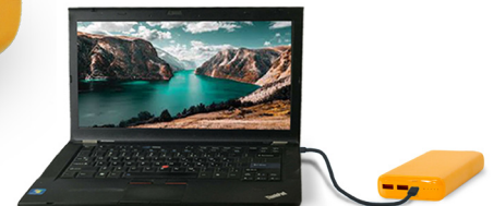
(Laptop not included)