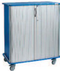
Front Sliding Doors Closed