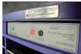
Intelligent Charging System