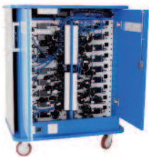
Back Doors Open